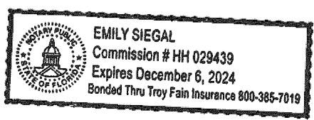
(NOTARY PUBLIC SEAL)