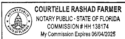
(NOTARY PUBLIC SEAL)