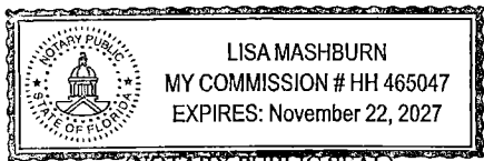
(NOTARY PUBLIC SEAL)